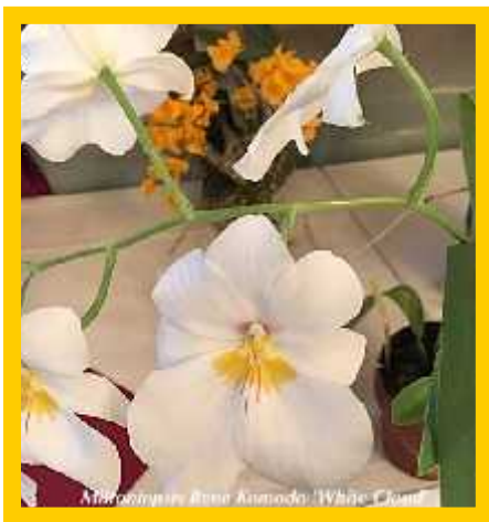
Brought to the May Show Table by Tom Russell. Tom grows under lights in intermediate conditions.