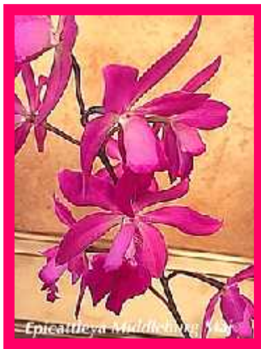
Brought to the May Show Table by Tom Russell. Tom grows under lights in intermediate conditions.