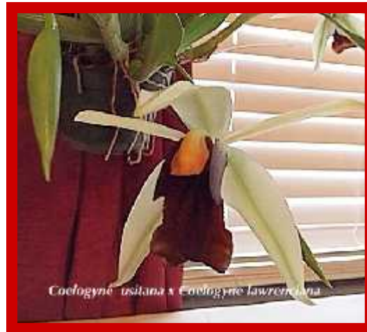
Coelogyne usitata x Coelogyne lawrensoniana