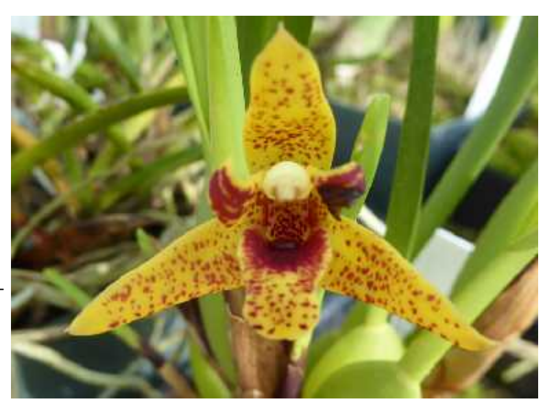
Maxillaria Ben Berliner