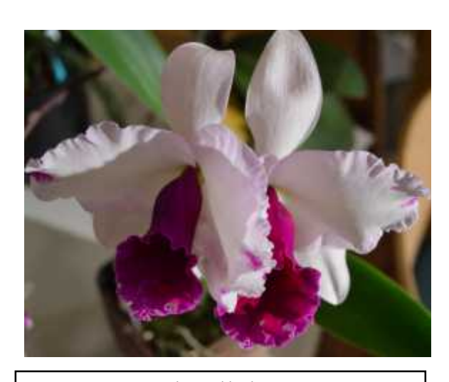
Show Table plant