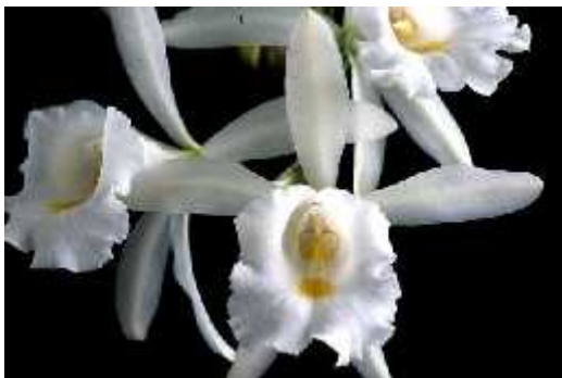
Trichopilia hennisiana 'Sue' CHM/AOS