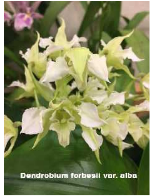
Dendrobium forbesii var. alba