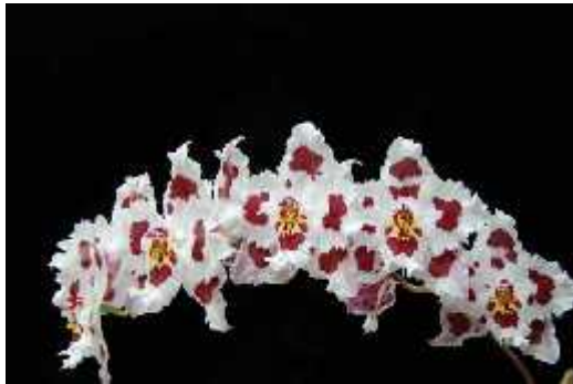
Odontoglossum Teresa Heinz Kerry 'Solar Place' AM/AOS

Wednesday, November 16, 2016 @ 8:30 – 9:30 pm EST. Members Only