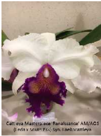
Cattleya Masterpiece 'Renaissance' AM/ACS (Ieda x Soun Fsk) Syn. Laellincattleya