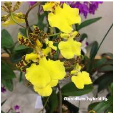
Oncidium hybrid sp.