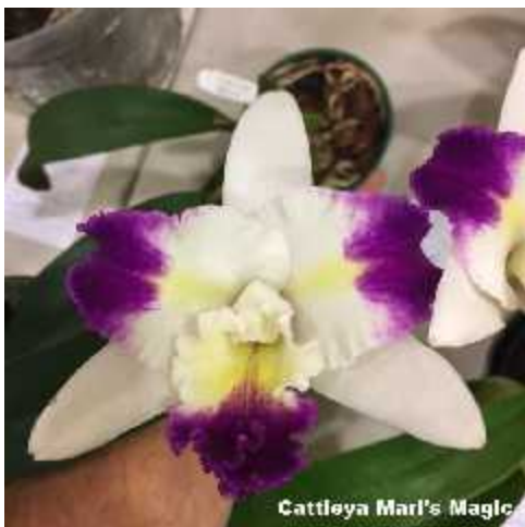
Cattleya Marl's Magic