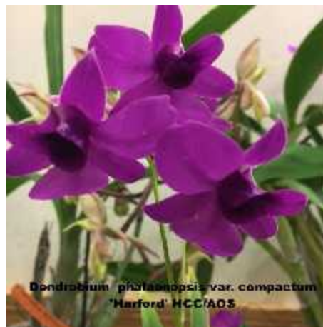
Dendrobium phalaenopsis var. compactum 'Harford' HCC/AOS