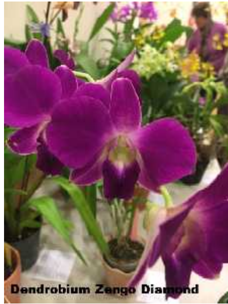
Dendrobium Zengo Diamond