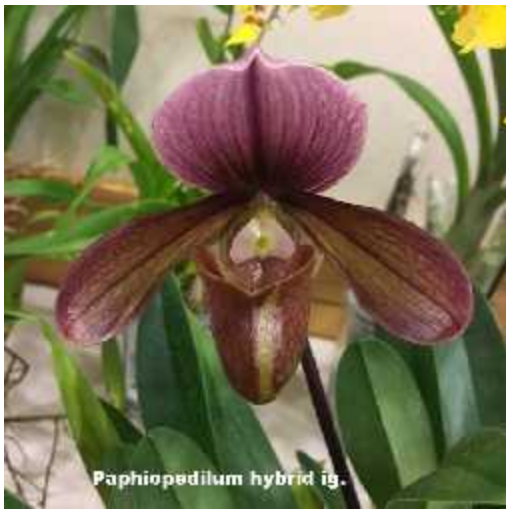
Paphiopedilum hybrid sp.