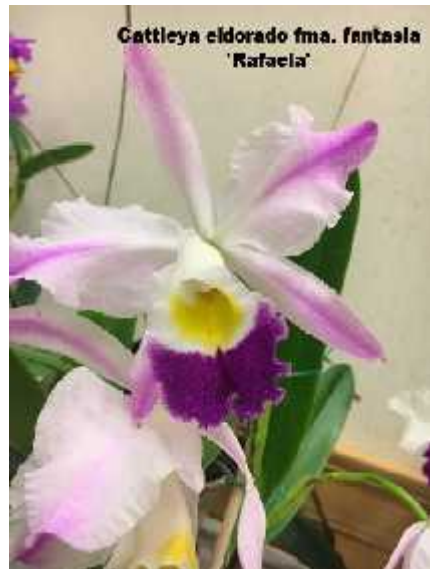
Cattleya eldorado fma. fantasia 'Rafaela'