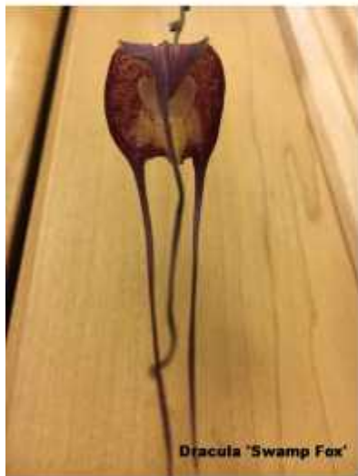
Dracula 'Swamp Fox'