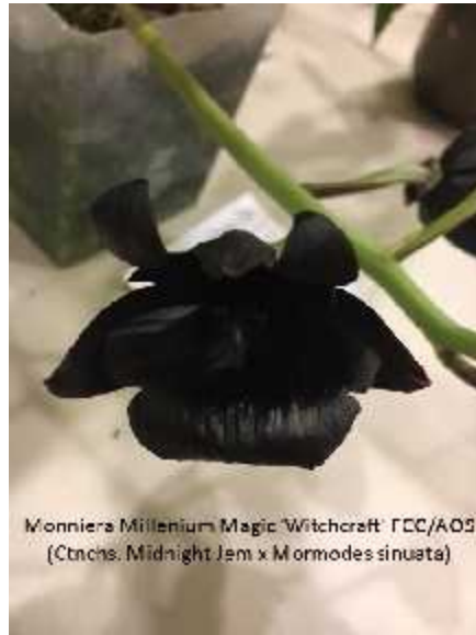
Moniera Millenium Magic 'Witchcraft' FCC/AOS (Ctnchs. Midnight Gem x Mormodes sinuata)