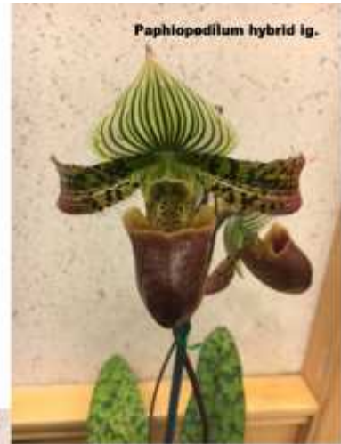
Paphiopedilum hybrid lg.