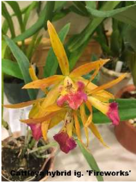
Cattleya hybrid ig. 'Fireworks'