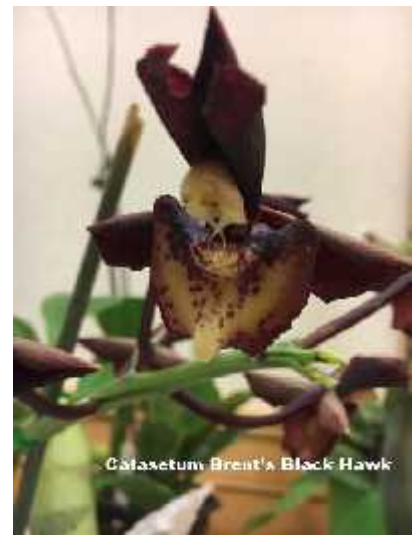
Catasetum Brent's Black Hawk