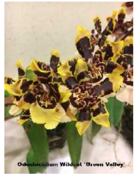
Odontocidium Wildcat 'Green Valley'