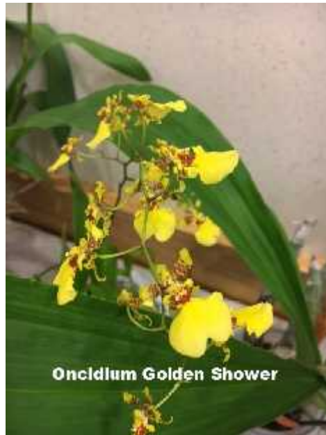
Oncidium Golden Shower