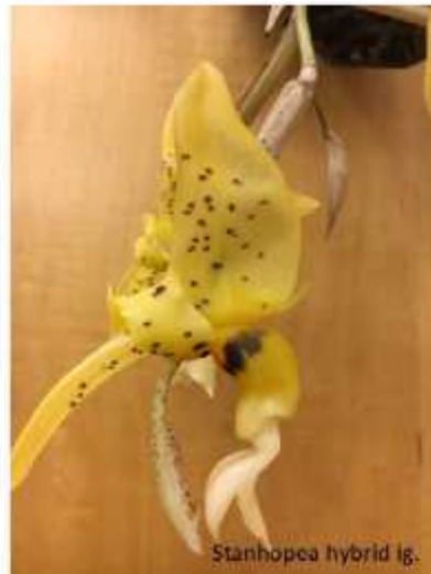
Stanhopea hybrid lg.