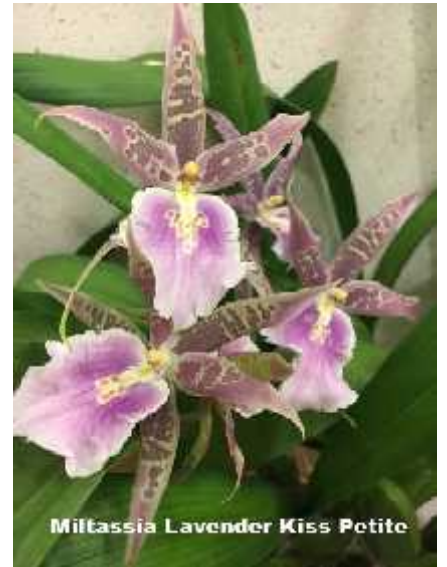
Miltassia Lavender Kiss Petite