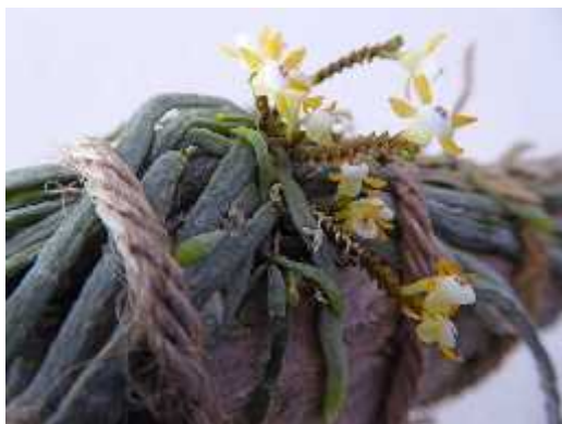
Taeniophyllum pusillum , a leafless orchid.

Grown by Larry Kuekes.