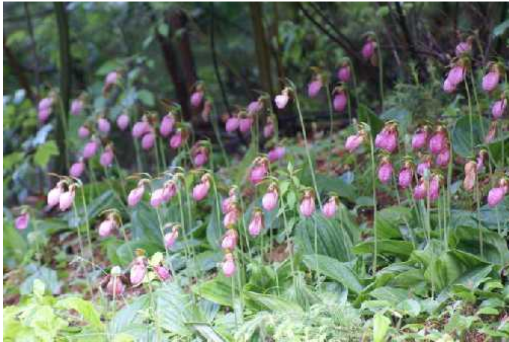
A crowd of lady slipper plants in a New England forest.

Lady Slipper Growth & Survival A stubborn plant, the lady slipper can take many years to grow and develop from seed to mature plants. They rely on a process called symbiosis to survive, which is typical of most orchid species. Symbiosis is when an organism, in this case a fungus found in the soil, is needed for a plant to grow and thrive. The fungus breaks open the lady slipper seed and attaches to it, passing on the food and nutrients needed for it to flourish. Once the lady slipper is mature and producing its own nutrients, the fungus will extract nutrients from the orchid roots.