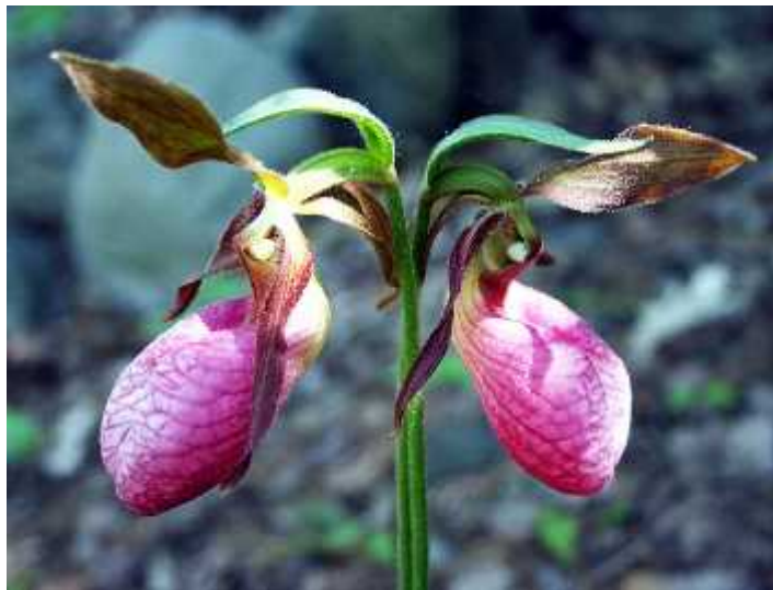
Is the lady slipper flower endangered? We set out to learn more. Here’s a lovely lady slipper specimen in Amherst, New Hampshire.

The lady slipper flower —also known as the moccasin flower — is North America’s own much admired and often misunderstood wild native orchid. Here you’ll learn more about the folklore, growth process, and growing conditions of this beautiful and alluring New England wildflower.