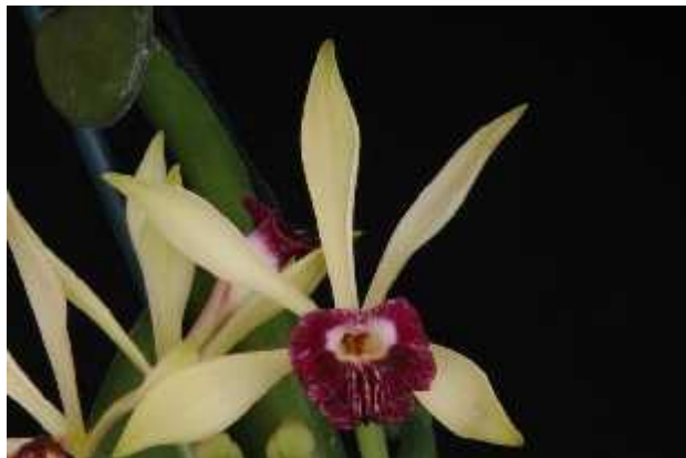
Vanilla imperialis 'Denver Botanic Gardens' HCC/AOS; Photographer: Unknown

Thursday, June 22, 2017 @ 5:30 pm—6:30 pm EDT Members only