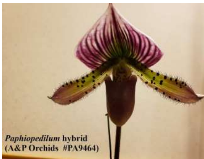
Paphiopedilum hybrid (A&P Orchids #PA9464)