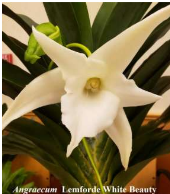
Angraecum Lemforde White Beauty