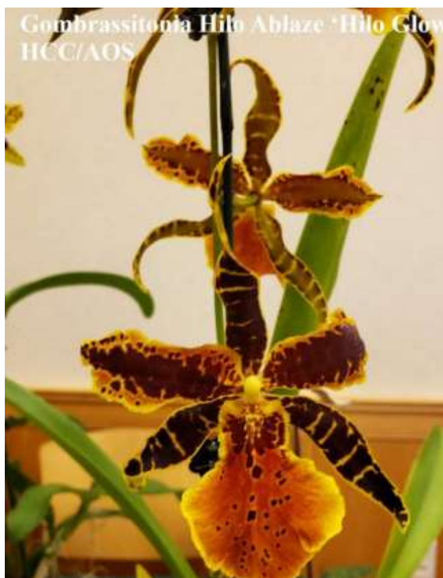
Gombrassitonia Hilo Ablaze 'Hilo Glow' HCC/AOS