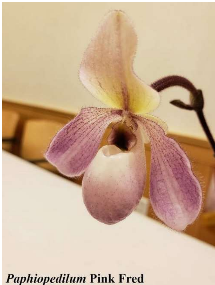
Paphiopedilum Pink Fred