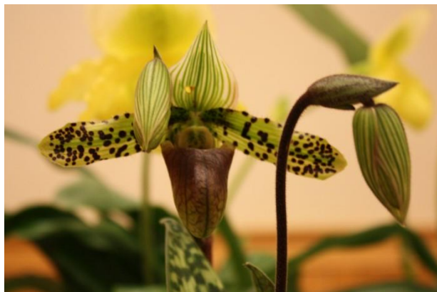
Paphiopedilum Memoria ChaCha Sprintz