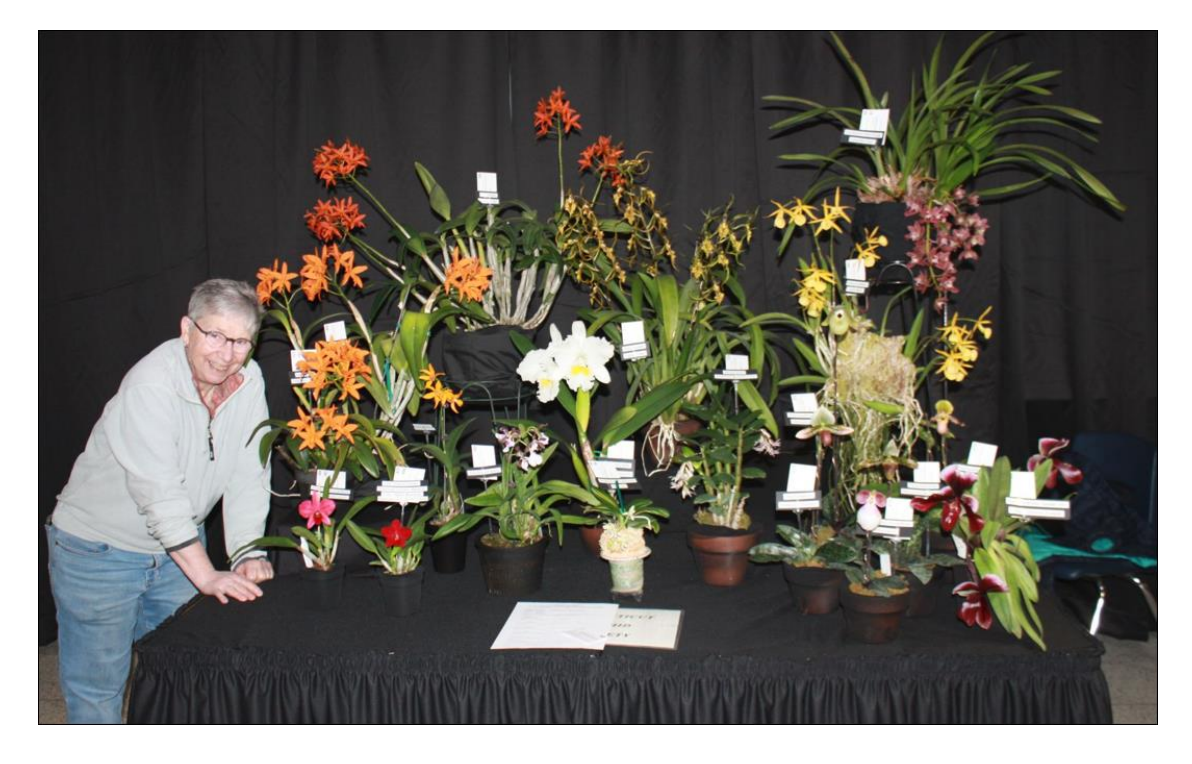
Table set up and photo by Dave Tognalli and Sue Kennedy

The Connecticut Orchid Society <u>www.ctorchids.org</u>