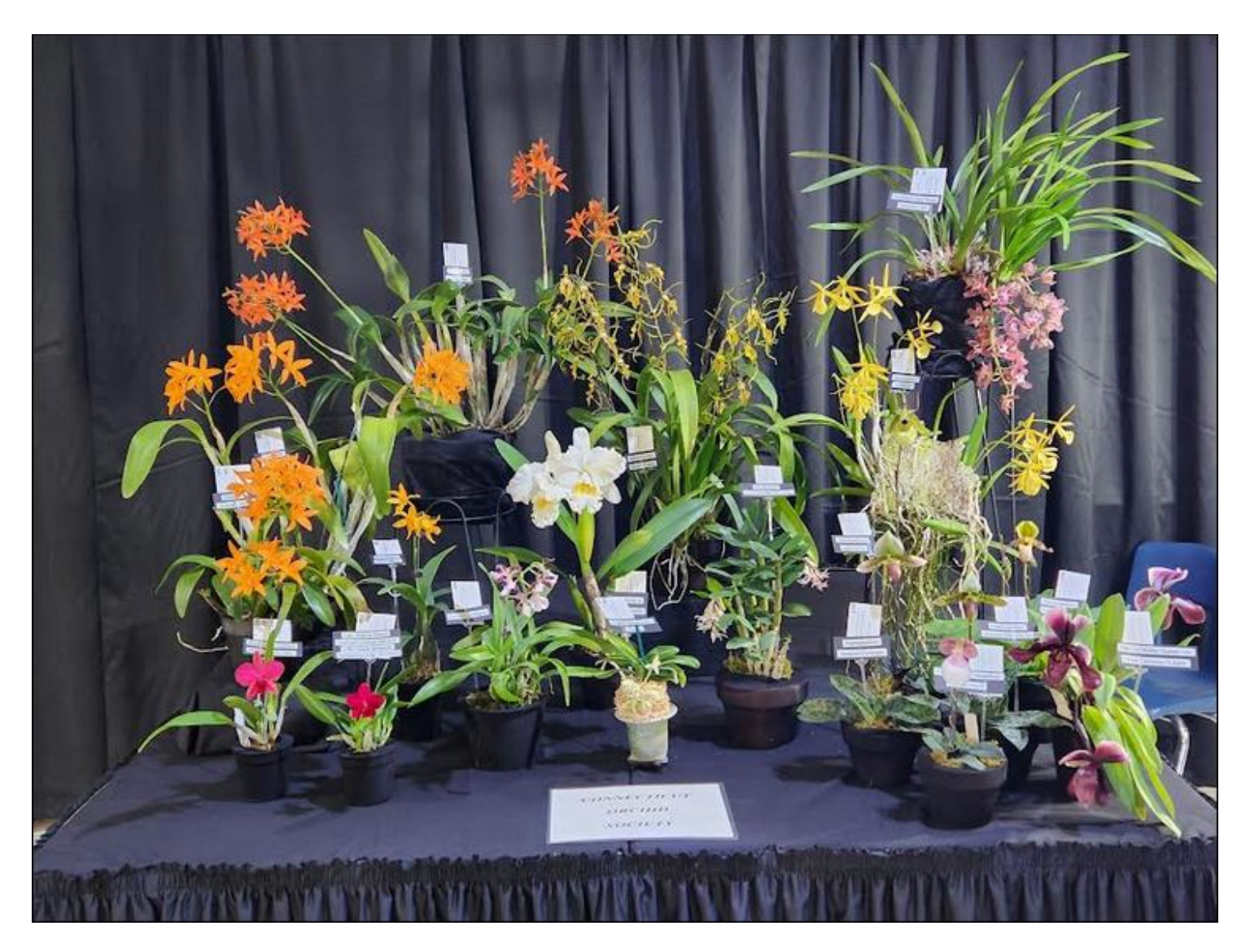
Table set up and photo by Dave Tognalli and Sue Kennedy