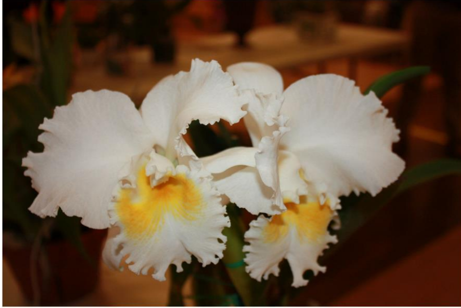
Cattlianthe Fire Dance 'Patricia' AM/AOS