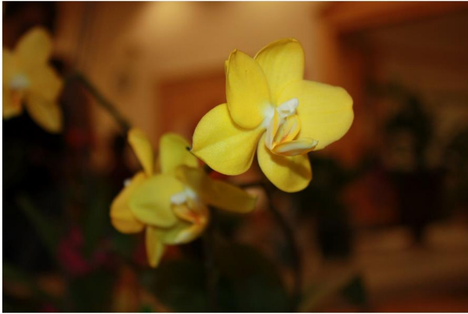
Phaleanopsis hybrid ig. large white