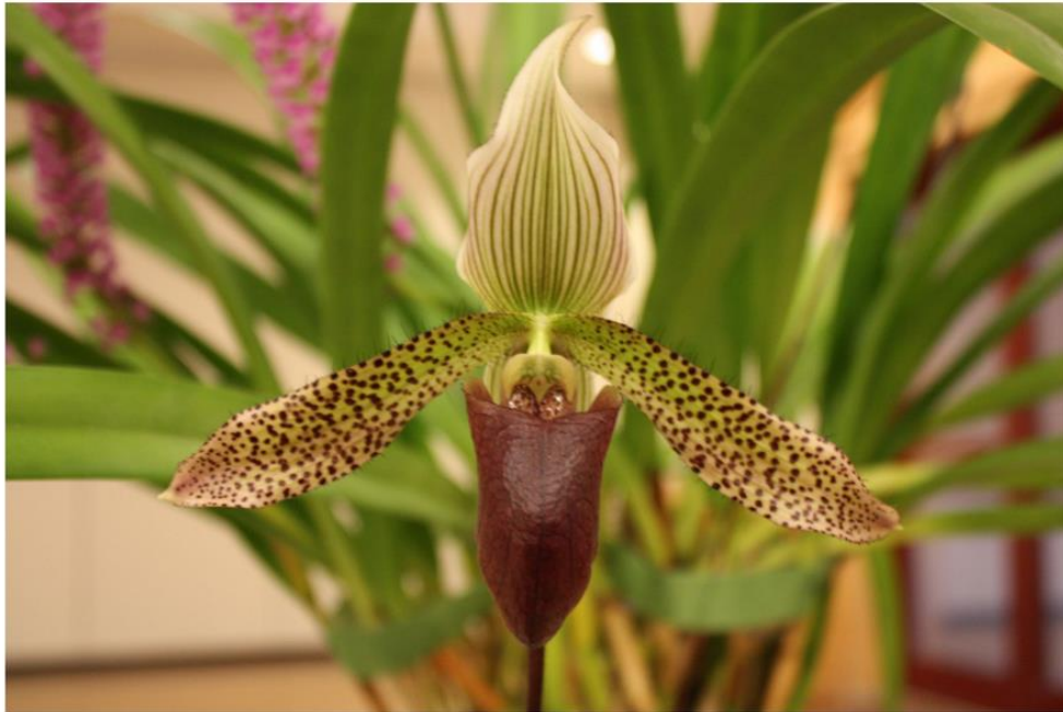
Paphiopedilum (Inca Gold x Gene Hughes) x ((Flight Path x Tree Village) x Winston Churchill 'Redoubtable' FCC/AOS)