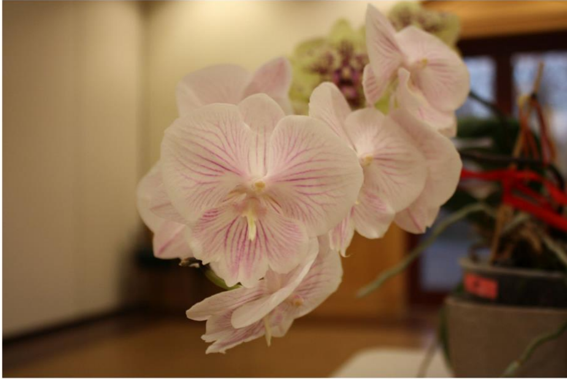
Phaleanopsis hybrid ig. yellow