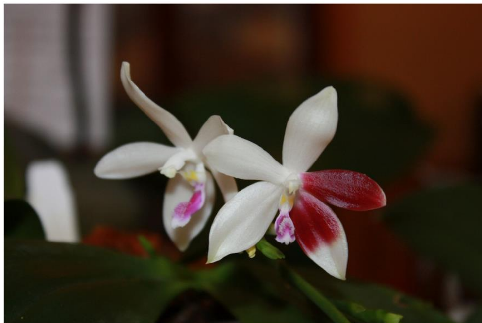
Phaleanopsis Younghome Snow White