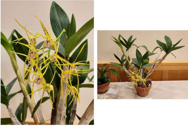
Dendrobium Hilda Poxon