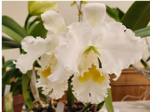
Cattleya Nancy Off 'Linwood' AM/AOS