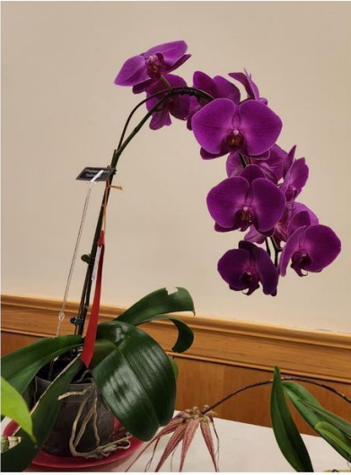
Phalaenopsis hybrid ig. royal purple