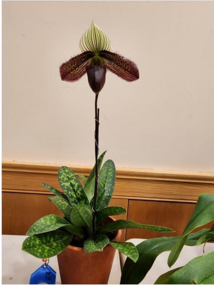
Paphiopedilum Petula's Sensation