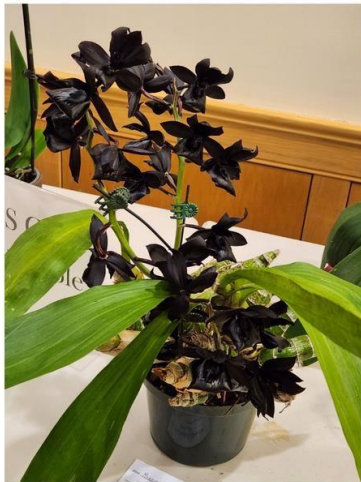
Monnierara Millenium Magic 'Witchcraft' FCC/AOS