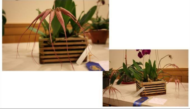
Bulbophyllum Elizabeth Ann 'Buckleberry' FCC/AOS