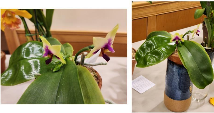
Phalaenopsis bellina 'Crystelle' FCC/AOS