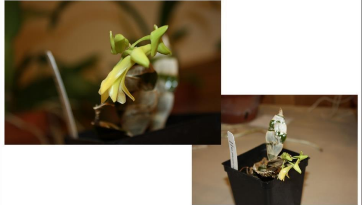
Dendrobium platycaulon x sib