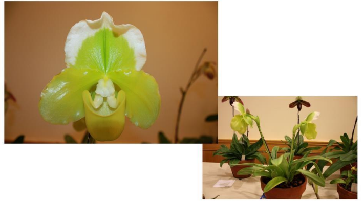
Paphiopedilum Stone Lovely 'Lucky Pick' x Paphiopedilum Sorcerer's Prime 'Green Giant'