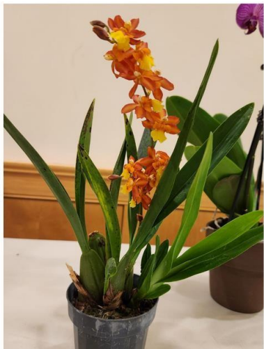
Oncidium Volcano Midnight 'Volcano Queen'