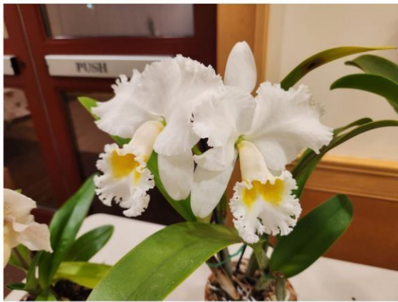
Cattleya Bow Bells 'Rex' AM/AOS