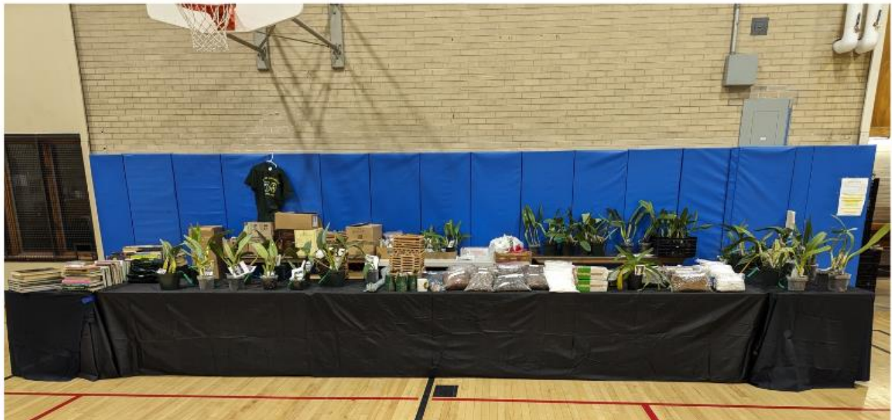
The COS Club sales table stocked and ready for the Saturday morning rush!