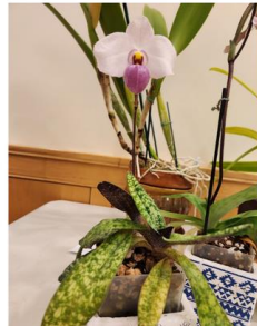
Phalaenopsis hybrid ig. ‘Big Lip’