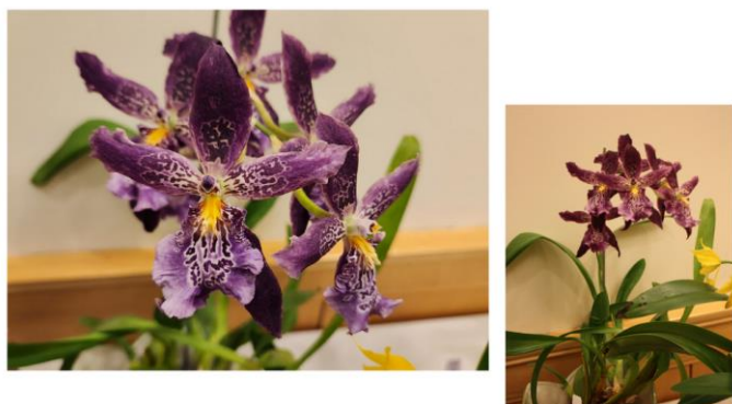
Aliceara Marfitch 'Howard's Dream' AM/AOS syn. Beallara