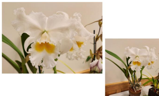
Cattleya Nancy Off 'Maria'