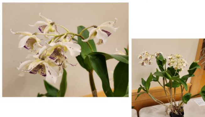
Dendrobium Royal Chip