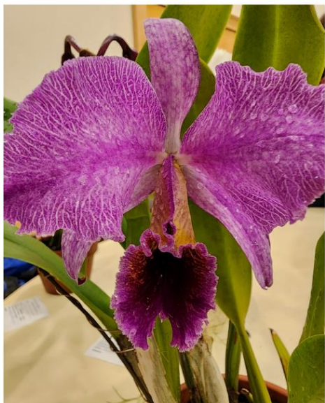
Cattleya percivaliana fma. marmoreada