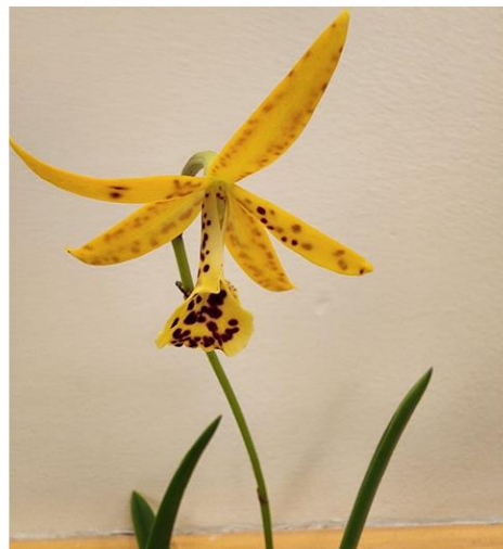
Cattleya Athena Chagaris 'Pisgah'