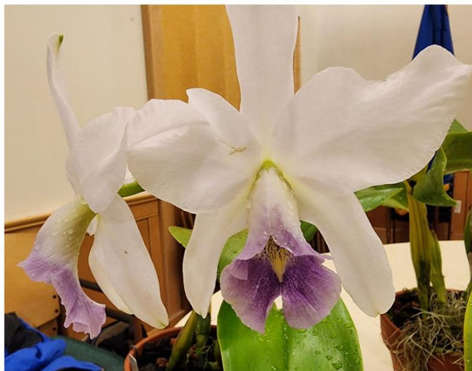
Laeliocattleya Marthe Haineault