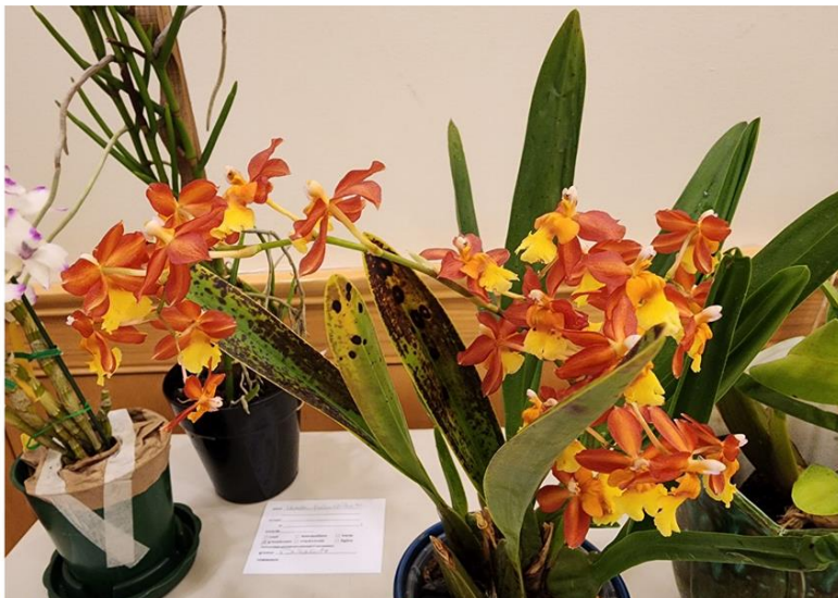
Oncidium Volcano Queen