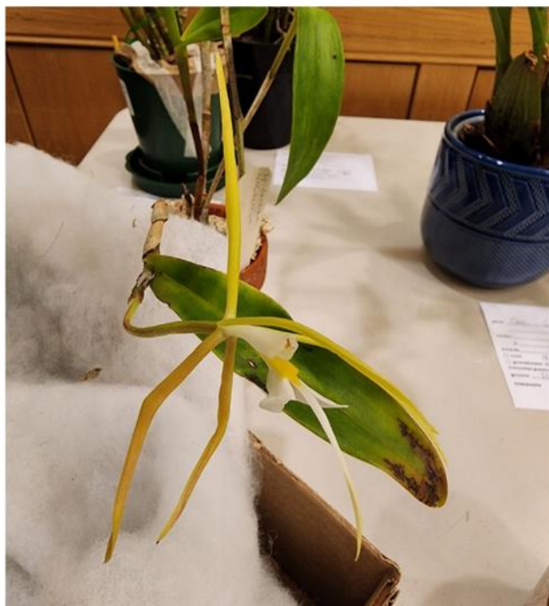
Dendrobium Love Memory 'Fizz' AM/AOS Galeandra Penny Lane