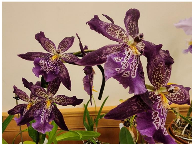
Catasetum Melana Davison x Catasetum Orchidglade

Aliceara Marfitch 'Howard's Dream' AM/AOS syn. Beallara