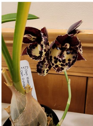
Cattlianthe Big Ben 'Blue Mountain' AM/AOS