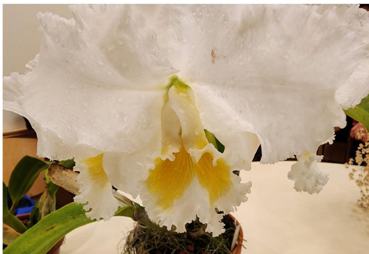
Cattleya x dolosa fma. alba 'Precious White'