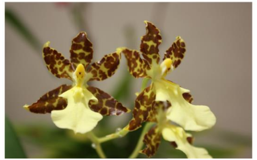
Oncidium hybrid ig.