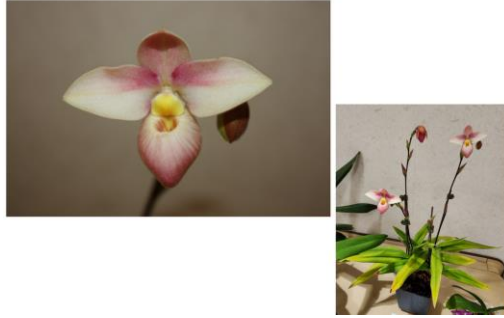
Phragmipedium Hanne Popow