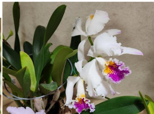
Cattleya mossiae semi-alba 'Aurora' AM/AOS