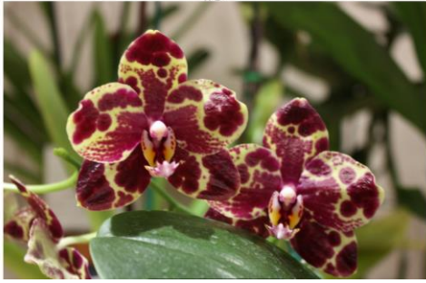
Phalaenopsis Yaphon Black Snake 'Mainshow #3'