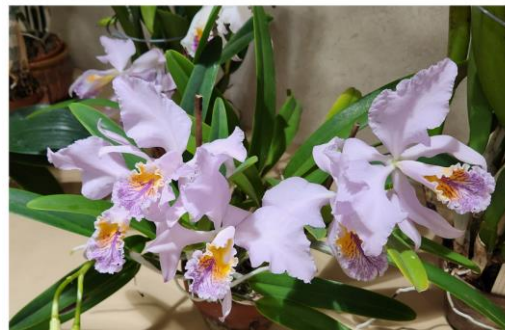
Cattleya mossiae 'Blue Two'