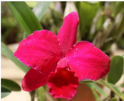
Rhynchoalealiocattleya Loud Nine