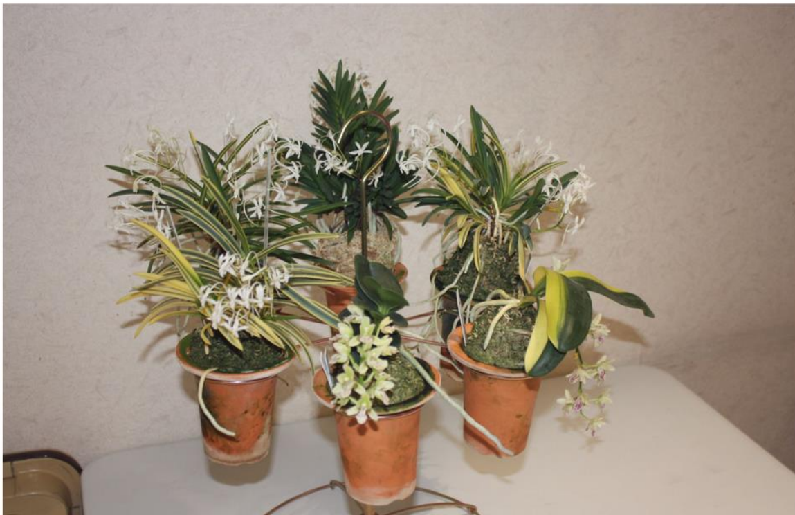
From the May Show Table