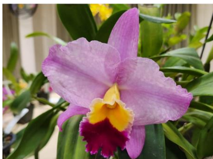
Cattleya Clive Brown 'Full Moon' (Horace x Orpetii)