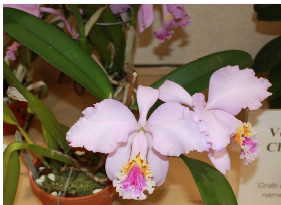
Cattleya tigrina 'Sunbar Giant' FCC/AOS Enanthleya Golden Sunburst