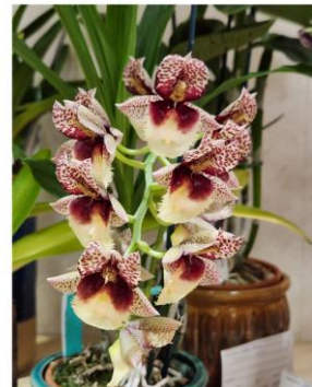
Catasetum Francisco Berrios Gines