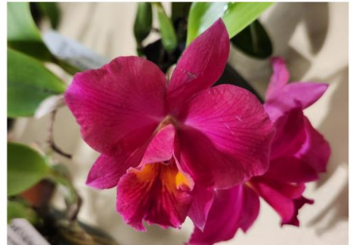
Rhynchoalealiocattleya Arnie's Life ( Cattleya Circle of Life x Rlc. Paradise Rose)