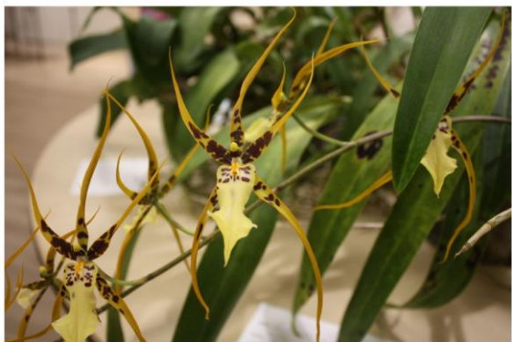
Brassia hybrid ig.