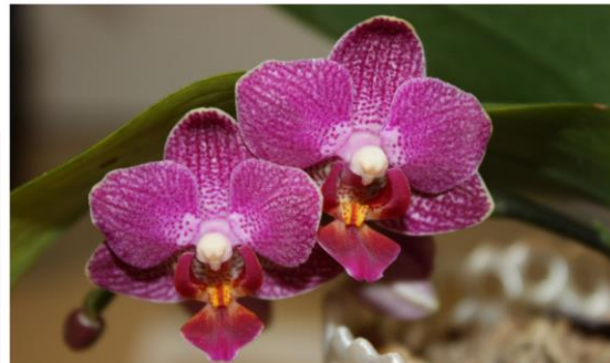
Phalaenopsis hybrid ig. 'Diane's Mini'