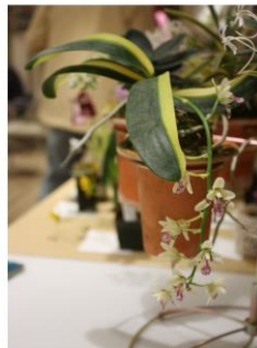
Phalaenopsis Pylo's Sofia 'Peter's Pride' HCC/AOS