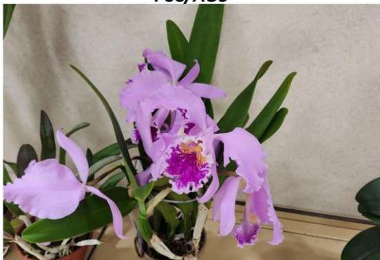
Cattleya mossiae 'Mrs. J. T. Butterworth' FCC/AOS