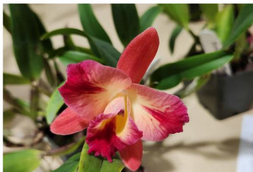
Cattleya Cosmic Candy x Cattleya Cosmic Angel