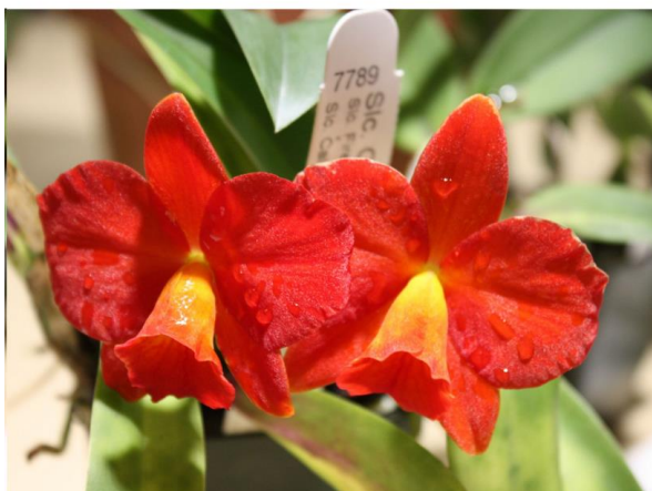
Cattleya Chili Sauce