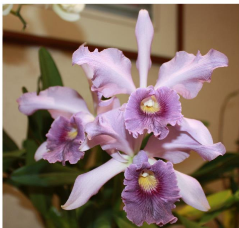
Cattleya Canhamiana var. coerulea