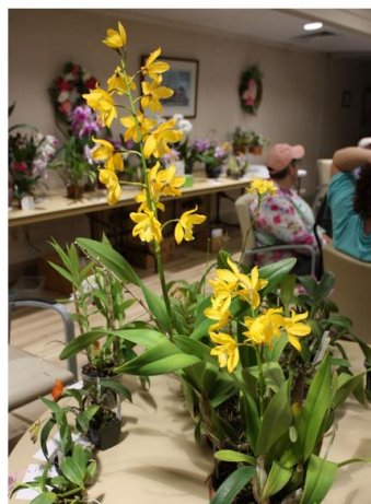
Epidendrum Yellow Magnolia 'SVO' 4N