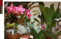
Phalaenopsis Sogo Yukidian