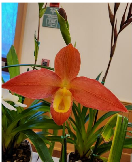
Phragmipedium Don Wember 'Max' AM/AOS