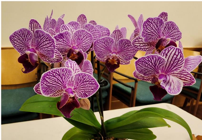
Phaleanopsis hybrid ig. 'Heather's Mini Purple'