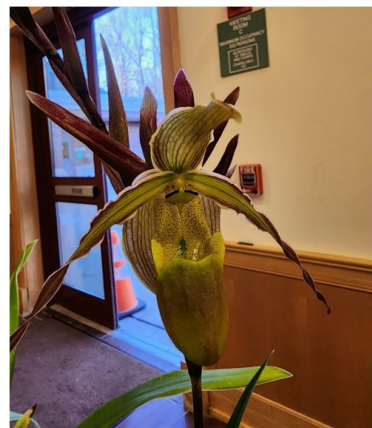
Phragmipedium longifolium 'Woodstream' AM/AOS