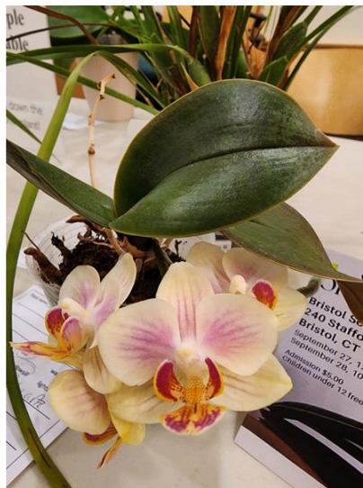
Phaleanopsis Sogo Allen 'Mini Stripes'