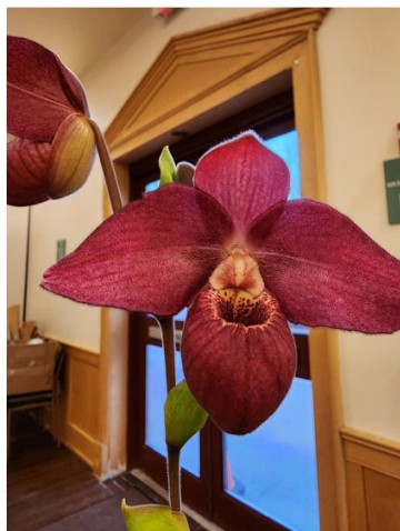
Phragmipedium Sue Omeis 'Pride of Mingoville' FCC/AOS