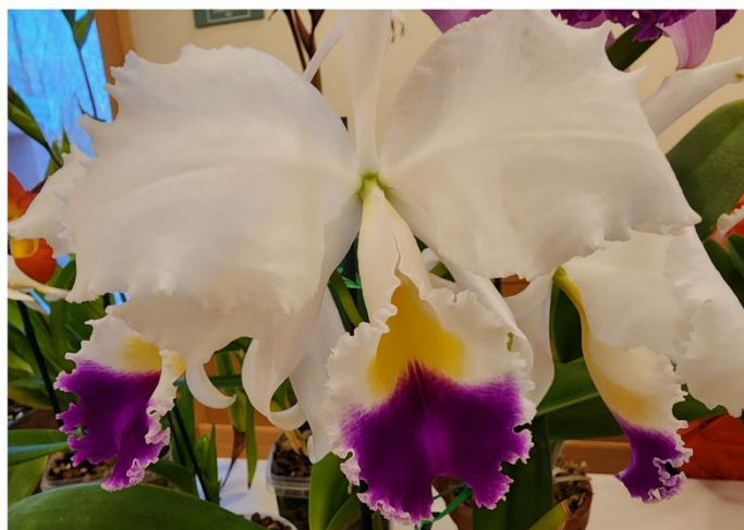
Cattleya trianaei fma. semi-alba 'Mother Domenica'