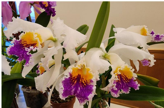
Cattleya mossiae fma. semi-alba 'Aurora' AM/AOS