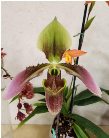
Paphiopedilum appletonianum var. hainanense 'Peggy' AM/AOS