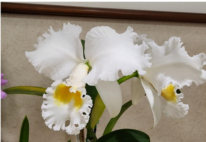
Cattleya Bow Bells 'Rex' AM/AOS