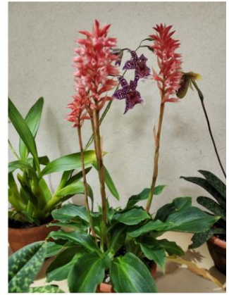
Rhyncholeliocattleya Pamela Hetherington 'Coronation' FCC/AOS