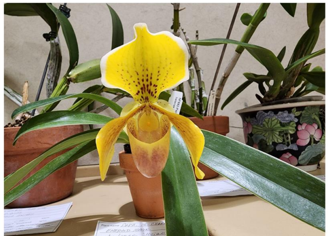
Paphiopedilum In-Charm Gold 'Emerald Magic' x Paphiopedilum helenae 'Hsiao'