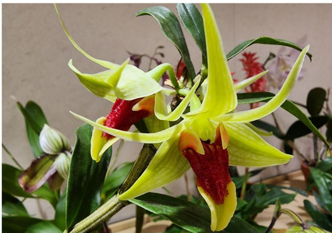
Dendrobium Hsinying Tobazuki