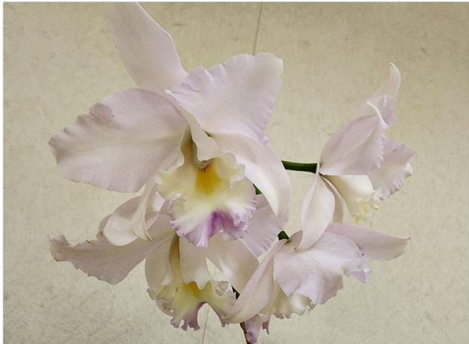
Laeliocattleya Puppy Love