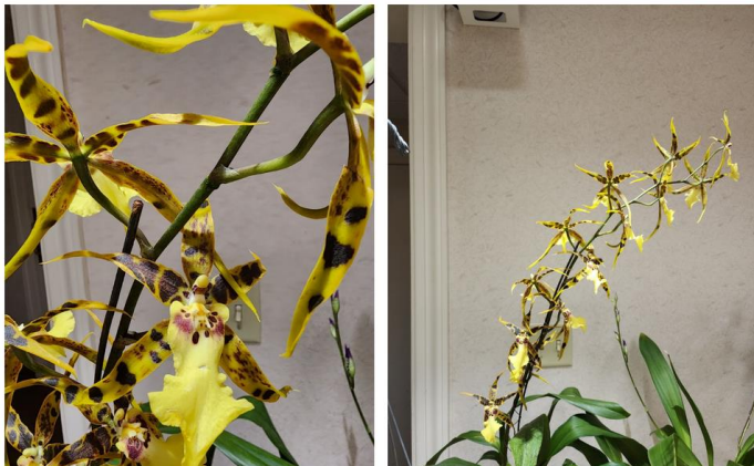
Aliceara Pacific Nova 'Okika' AM/AOS