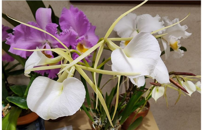
Brassavola nodosa 'Mas Mejor' AM/AOS