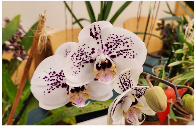
Phragmipedium Tall Tails 'Max' AM/AOS