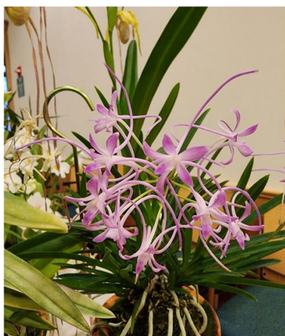
Vanda falcata pink