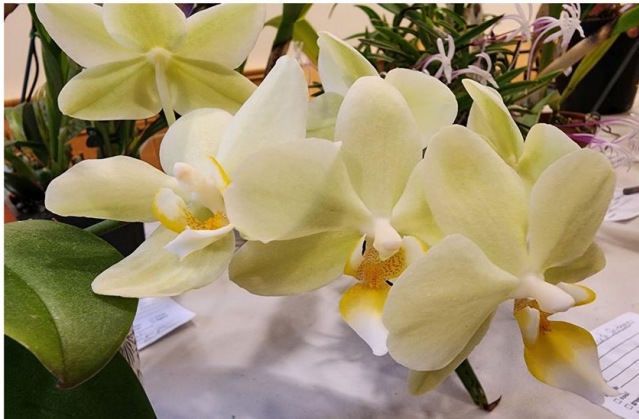
Phalaenopsis hybrid ig. 'Jacqui's Yellow Mini'