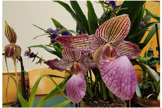
Paphiopedilum Gloria Naugle 'Burgundy' AM/AOS