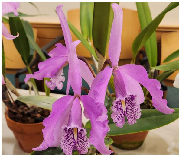
Cattleya purpurata var. coerulea 'Sweet Twilight' x Cattleya purpurata var. werkhauseri 'Blue Sky'