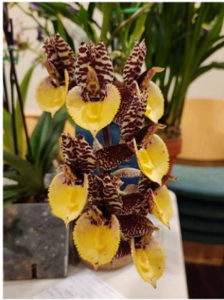
Catasetum Desmond Dreisewerd