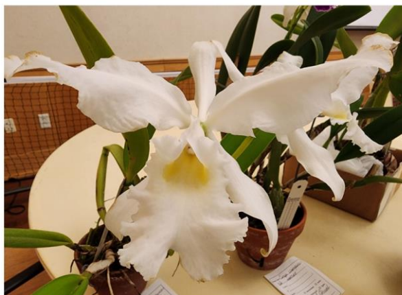
Cattleya warscewiczii 'Fabio Nahas' AM/AOS