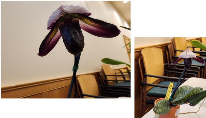
Paphiopedilum Magic Cherry